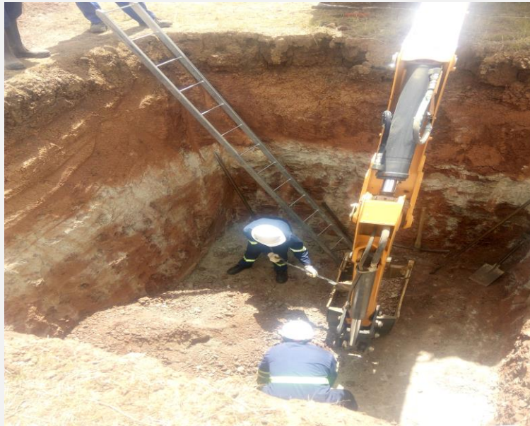
Earthworks preparations for kV Line poles installation