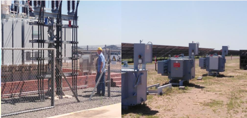
Substation works and site preparations