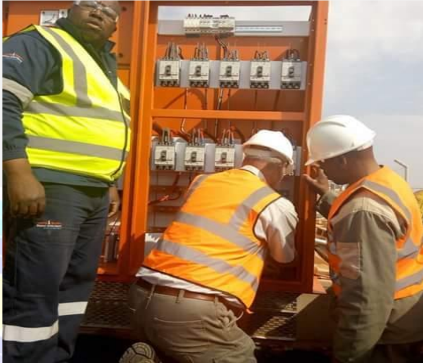
Main Distribution Board(D.B) Installation and Testing