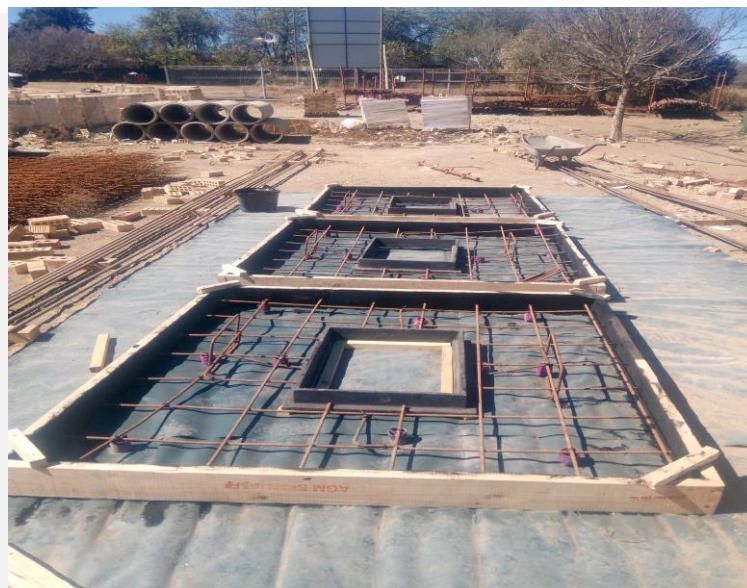
Storm water drainage erection and catch pit erection