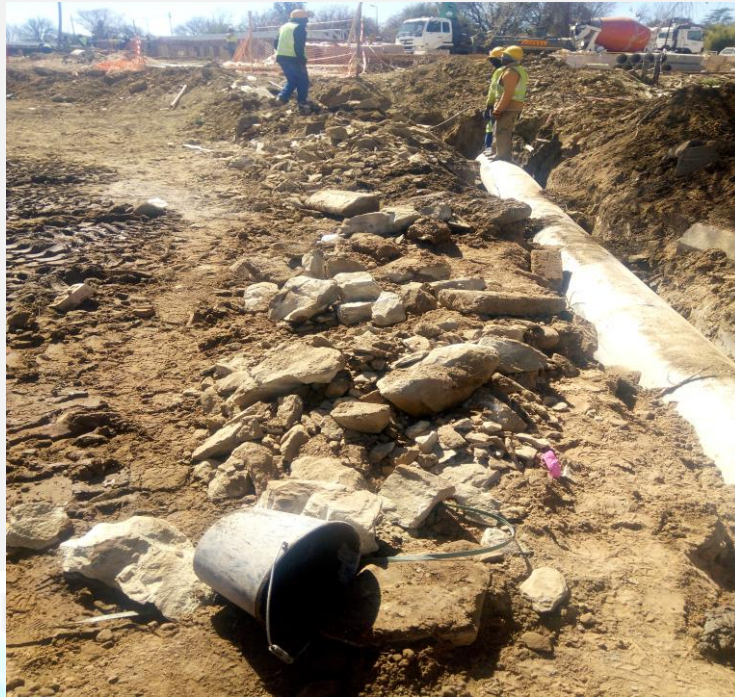
Erection of new storm water drainage