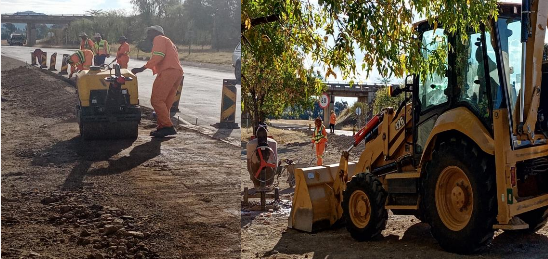
R709 Provincial Road Rehabilitation