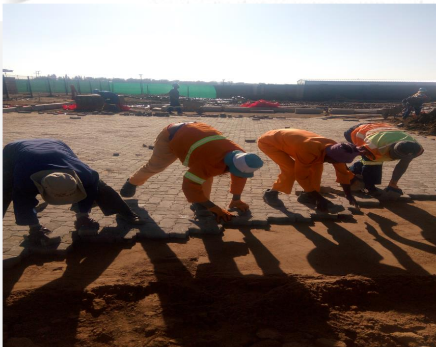
Paving of walkways, ground preparation and road works