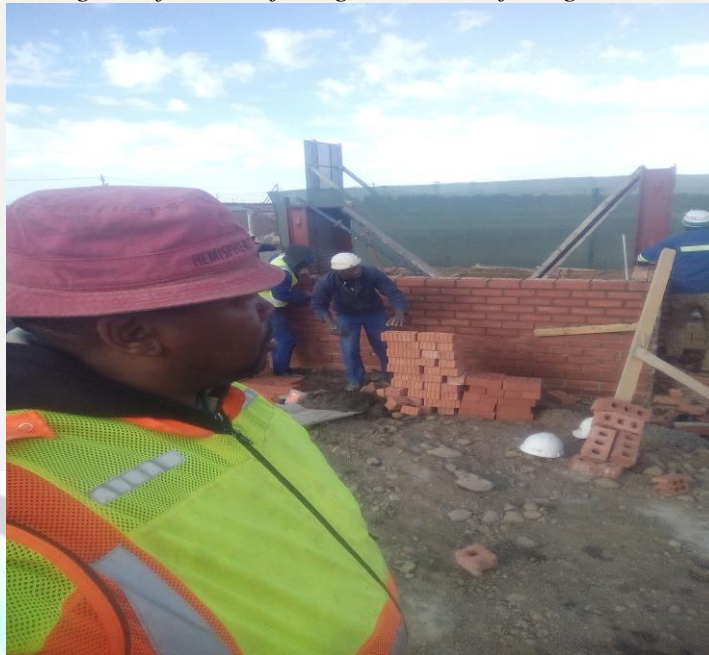
Bricklaying and General building