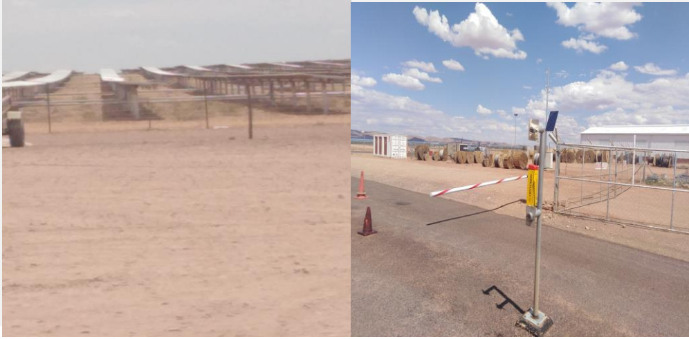
Modules & Cable-pulling and installation

Appointed as subcontractor/service provider after site erection completion at Siriur Photovoltaic Plant for SNC-Lavalin at Upington, N/Cape – modules and cable-pulling sleeves installation.